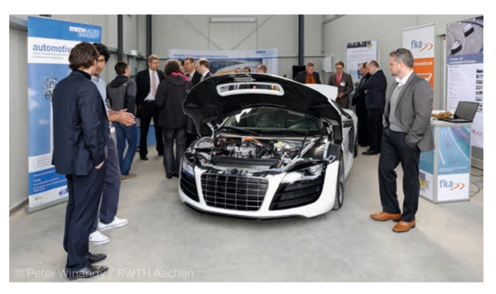
The following examples should give you an idea of what is possible at the Aldenhoven Testing Center. Of course, other event formats beyond those described here are also possible.

The Aldenhoven Testing Center is not only suitable for events with your customers but also for internal staff gatherings or get-togethers for your sales team. To create unforgettable moments, we can provide instructors who will guide your employees or customers through driving maneuvers on the test tracks.